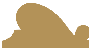
20 X 38mm 1061