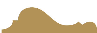
14 X 50mm 1009M