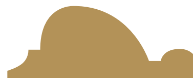
20 X 50mm 1086M