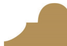
20 X 28mm 1033